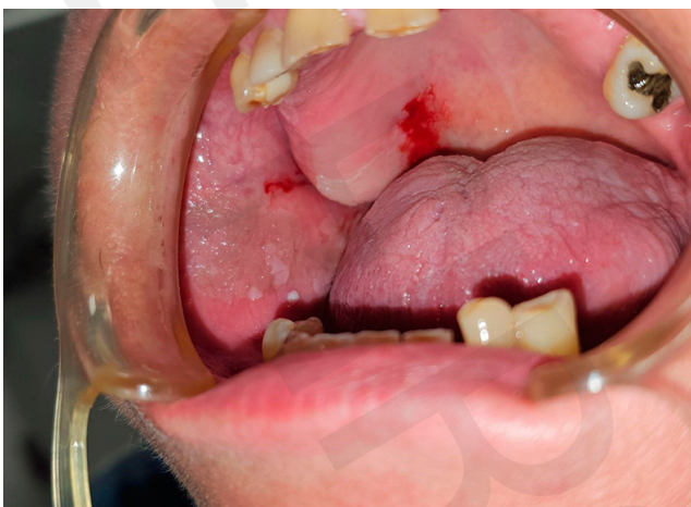
Figure 1. Leukoplakia-like foci on the right cheek and right maxillary tuberosity

About one and a half years later, the patient returned to the Department of Oral Medicine with lesions on the right maxillary tuberosity. She reported that previous tongue foci were removed using laser therapy in a private clinic. Oral examination revealed diffuse white leukoplakia-like lesions in the right maxillary tuberosity extending to the cheek mucosa [Fig. 1]. Small and painless foci were also visible on the mucosa of the left cheek and tongue. A biopsy was ordered by a specialist in dental surgery, and the patient was advised to use vitamin mouthwash and oil treatment. One month later, the patient returned to the Department of Oral Surgery for a biopsy of exophytic lesions on both sides of the cheek, and on the right side of the mandibular region. Following extended diagnostics and cardiology consultation, a VelScope examination revealed fluorescence [Fig. 2]. A 10×7 mm mass was detected on the dorsal surface of the tongue. Six months earlier, the patient underwent a biopsy elsewhere for viral papilloma-like lesions that confirmed histopathologically. The histopathological analysis of the recent tongue lesion biopsy was non-diagnostic. A local anaesthetic procedure using articaine with adrenaline was performed for diagnostic excision of the tongue lesion and mucosal biopsy of the right maxillary. The wound was sutured in layers and Myzotec applied. After about a month,