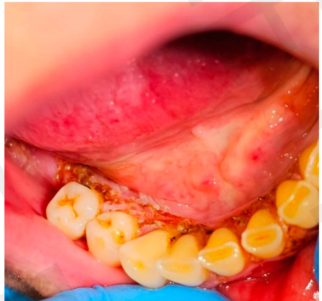
Figure 7. Status post-laser treatment of the latest lesions in the oral cavity