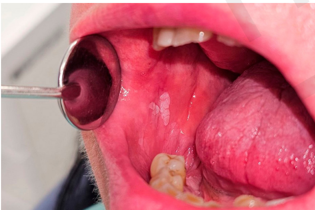
Figure 5. Recurrence of leukoplakia-like changes one month after the last appointment. Visible changes on the mucous membrane of the cheek and the mandibular alveolar process from the lingual side

The following month, the patient, once more, underwent the aforementioned procedures due to recurrence of lesions on the mucous membrane of the cheek and the lower lingual alveolar. [Fig. 5] The removal of the lesion with a laser resulted