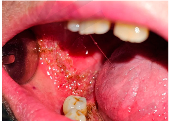
Figure 6. Status post-laser treatment of the latest lesions in the oral cavity

in charring of the mucous membrane of the cheek and the mandibular alveolar process. The treatment approach was modified from cryotherapy to laser therapy due to issues with recurrency. Simultaneously, at the time of the patient's initial consultation, oral lesions presented with WHO grade 2 leukoplakia and following several cryotherapy applications to treat recurrences, the lesions displayed a regression to grade 1 leukoplakia. This progressive reduction in leukoplakia grading suggests that cryoapplication effectively reduced the severity of the lesions. The lesion remains under healing treatment and requires further observation [Fig. 6 and 7].