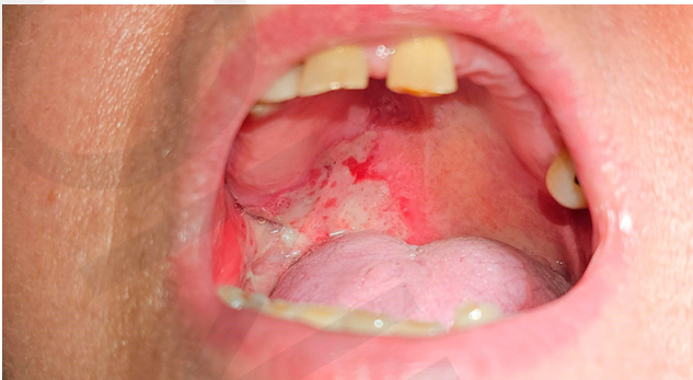
Figure 4. Status post-cryotherapy treatment after approximately one year since the first visit applying to leukoplakia-like spots

One week later, necrotic epithelium was evident at the freezing site, with mild pain and recession tendencies. At one month of follow-up, reduced epithelial opacity and scattered areas of mottled epithelium were observed, requiring adjunct laser diode treatment on the interdental papillae of teeth 43, 44, and 45, performed two months later. The ellexion claros laser was configured with specific operational parameters to optimize efficacy in clinical applications. The laser was set with a pulse output of 30W, a frequency of 20,000 Hz, and a pulse duration of 10 \mu s. This combination achieves a peak power output of 6.15 W.