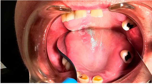
Figure 3. Status post-cryotherapy treatment after approximately one year after the first visit applied to leukoplakia-like spots