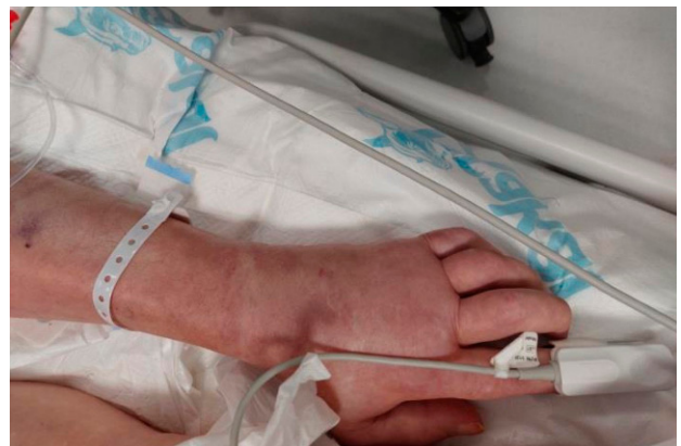
Figure 5. Pitting edema of the hand