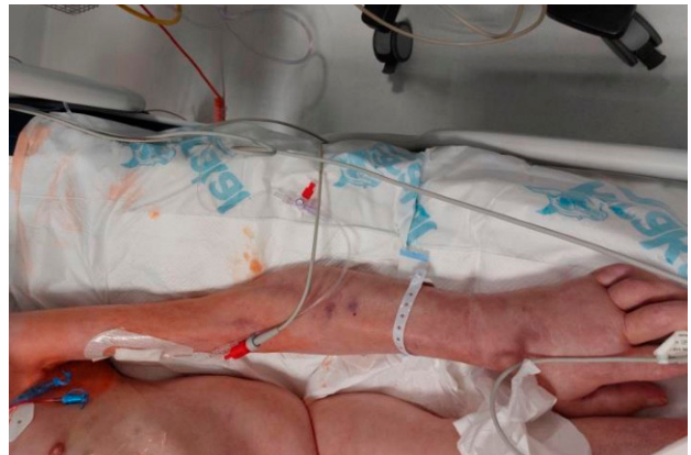
Figure 3. The arm is narrower than the shoulder