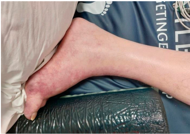
Figure 6. The photo shows pitting edema of the lower limb and slight cyanosis