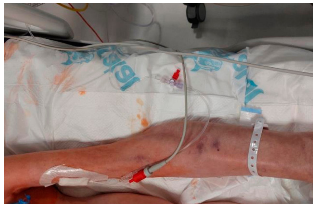
Figure 4. The arm is narrower than the shoulder