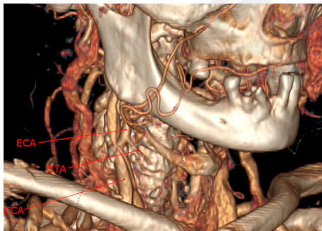
Figure 1. Superior thyroid artery (STA) arising from external carotid artery (ECA), just above bifurcation of common carotid artery (CCA) on the CT-angiography. From the collection of the Department of Medical Radiology I, Medical University of Lublin