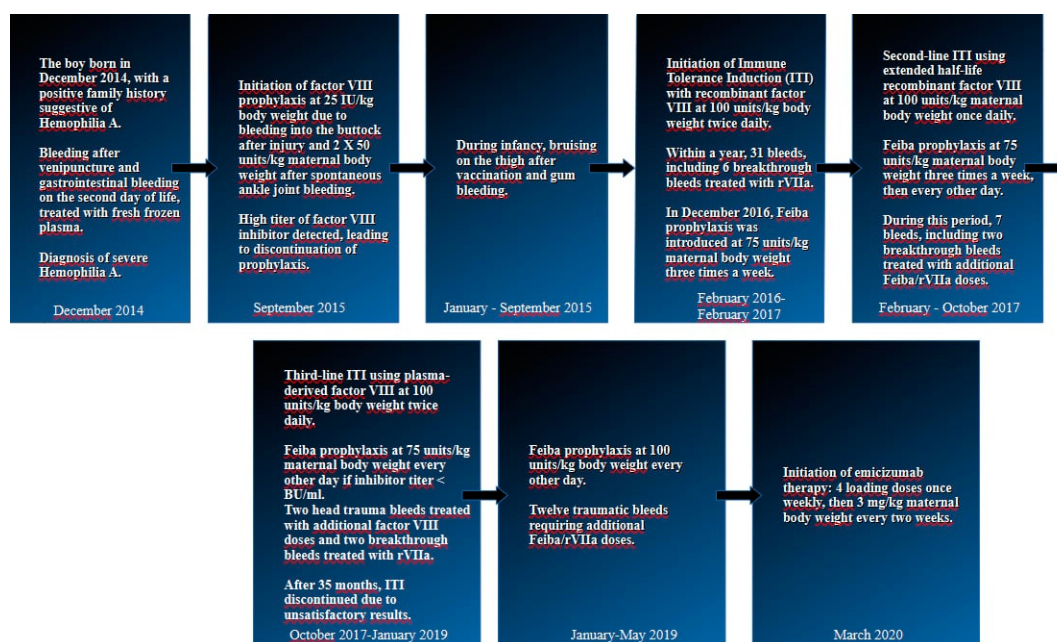
Figure 1. Timeline illustrating the patient's therapeutic process from birth to initiation of emicizumab treatment.

In November 2020, the boy sustained a significant cheek injury after hitting a chair. Cold compresses were applied. The patient did not require any haemostatic