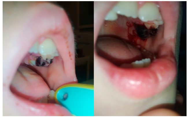
Figure 3. Haemorrhagic cyst formed after removal of the deciduous tooth root

Since the initiation of emicizumab treatment, episodes of right humeral bone fracture and the occurrence of a