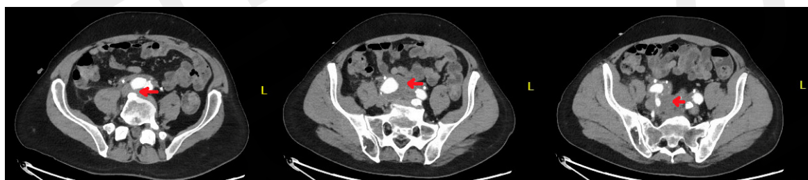
Figure 2. Image of the retroperitoneal space tumour in the described patient on abdominal and pelvic CT scan. The arterial phase. Red arrows – image of the tumor around the aortic bifurcation and iliac arteries