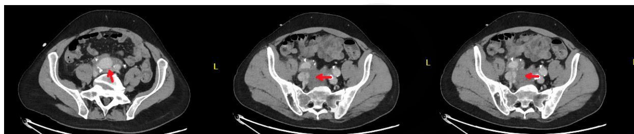
Figure 3. Image of the retroperitoneal space tumour on abdominal and pelvic CT scan. The venous phase. Red arrows – image of the tumour around the aortic bifurcation and iliac arteries.