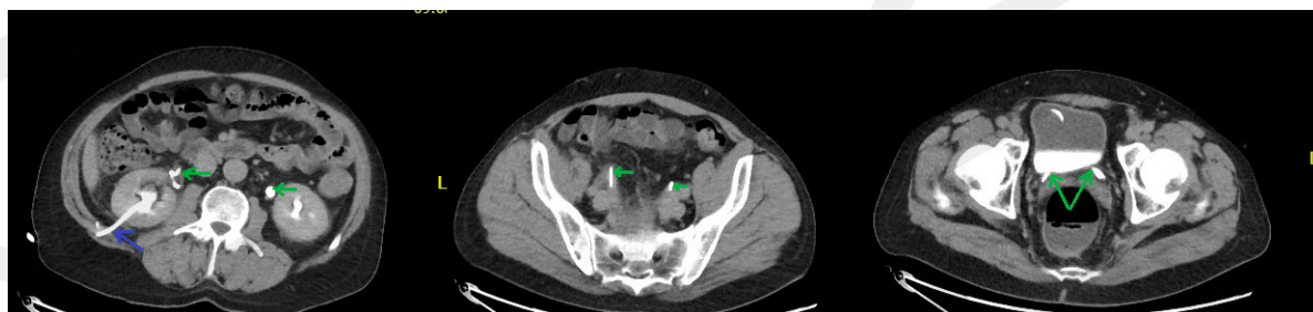
Figure 4. Image of the retroperitoneal space tumour on abdominal and pelvic CT scan – delayed phase. Blue arrow – a nephrostomy, green arrow – DJ catheters