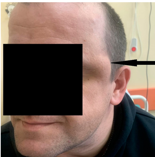
Figure 2A. Patient's face shows a mass on the left frontal temporal side (arrowed)

A similar mass measuring 1.6 \times 1.5 cm. was observed on the right side of the paraspinal muscles. The whole length of the