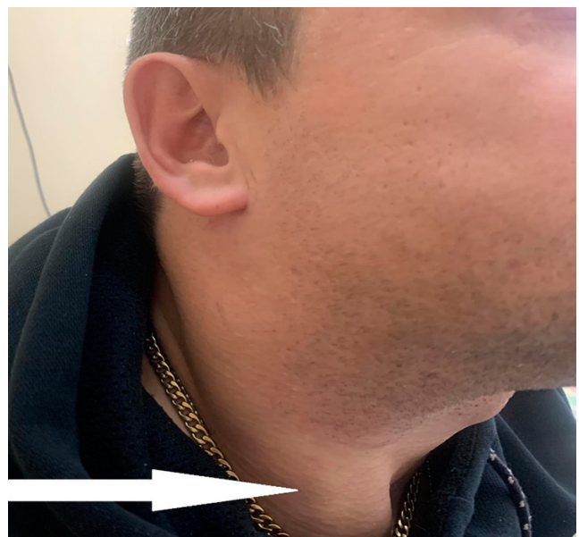
Figure 3. Patient's neck showing a mass on the right side of the neck (arrowed)

right sternocleidomastoid muscle is thickened to 5.5 \times 3.2 cm. A CT scan showed a 4 \times 3.7 cm mass surrounding the carotid arteries pressing on the right lobe of the thyroid gland, and displacing the larynx and throat to the left as shown in the photo (Figure 3).