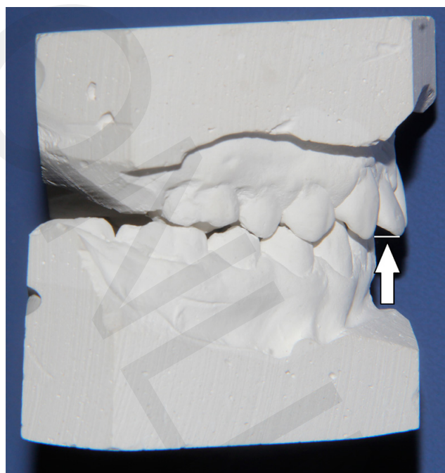
Figure 3. Anterior maxillary overjet