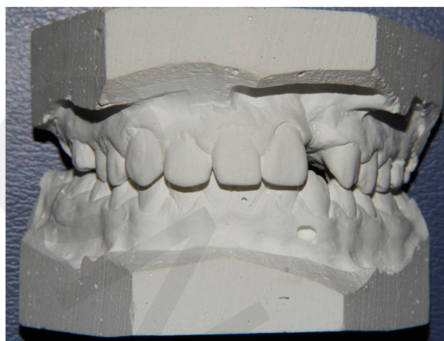
Figure 2. Spacing in incisal segments

III. Spacing in incisal segments. A condition in which the available space between the right and left canines was insufficient to accommodate all 4 incisors in normal alignment. If one or more incisal teeth had proximal surfaces without interdental contact, the segment was recorded as spaced. Results were recorded as in subsection 2 (0.1 or 2). In case of doubt, the lower score was awarded.