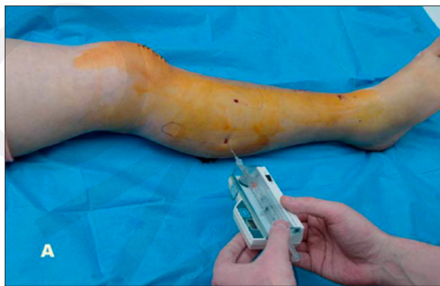
Figure 2. ICP measurement. Lateral compartment [26]

Compartment pressure monitoring. The most useful method in the diagnosis of ACS with which it is possible to obtain the value of the ICP parameter, which determines the correct diagnosis and the necessity for urgent surgical intervention. There are many devices for ICP monitoring, from traditional methods (Whiteside’s technique needle manometry) to the use of dedicated ICP monitors with a pressure transducer. In the method described by Whiteside, a needle is inserted into the muscle compartment and saline injected. The air resistance it must overcome is read as pressure by a mercury manometer connected through a tube to the needle [24]. Modern ICP measuring devices are also based during the injection of saline into the muscle compartment, and the pressure is read on the device’s screen (Stryker ICP monitoring system) (Fig. 2). The threshold for ACS is considered to be an ICP > 30mmHg. Today, the more commonly used parameter is delta pressure ( \Delta P ), calculated from the formula: diastolic blood pressure – ICP. A value of \Delta P < 30 mmHg is considered the borderline of urgent surgical intervention. The importance of measuring ICP in any compartment, not just the anterior compartment (burdened with the highest probability of ACS), is further emphasized [25].