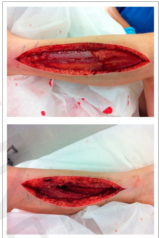
Figure 3. Fasciotomy of the left lower extremity. Upper image – lateral incision, lower image – medial incision [30]

Complications of ACS and fasciotomy. Complications after fasciotomy are common (up to 1/3 of patients), and include wound infection, suture separation, soft tissue necrosis, osteomyelitis or blood vessel damage [25,29]. The timing for closing an incision and debridement at the surgery are equally important factors in reducing complications after fasciotomy. It has been described that patients with a wound uncovered up to 4 days after fasciotomy were reported to develop infection at a lower rate than patients with a wound uncovered more than 7 days after surgery. Also in open fractures, early closure and limiting the amount of time the bone is uncovered helps to decrease the incidence of wound infection and osteomyelitis [46]. Rhabdomyolysis can develop secondary to ACS in about 40% of patients, leading to renal failure. If untreated, ACS can lead to more severe conditions. Limb amputation appears to be by far the worst complication and occurs in about 10% of ACS patients [31–33], and usually develops on the irreversible tissue loss and infection. In order to recover, patients must undergo difficult and long-term rehabilitation [40]. Another consequence of untreated ACS can be Volkmann's ischemic contracture. This is a relatively rare condition, most often occurring after upper extremity injuries. Muscle ischemia is caused by arterial embolism or specifically ACS (the most common cause of Volkmann's