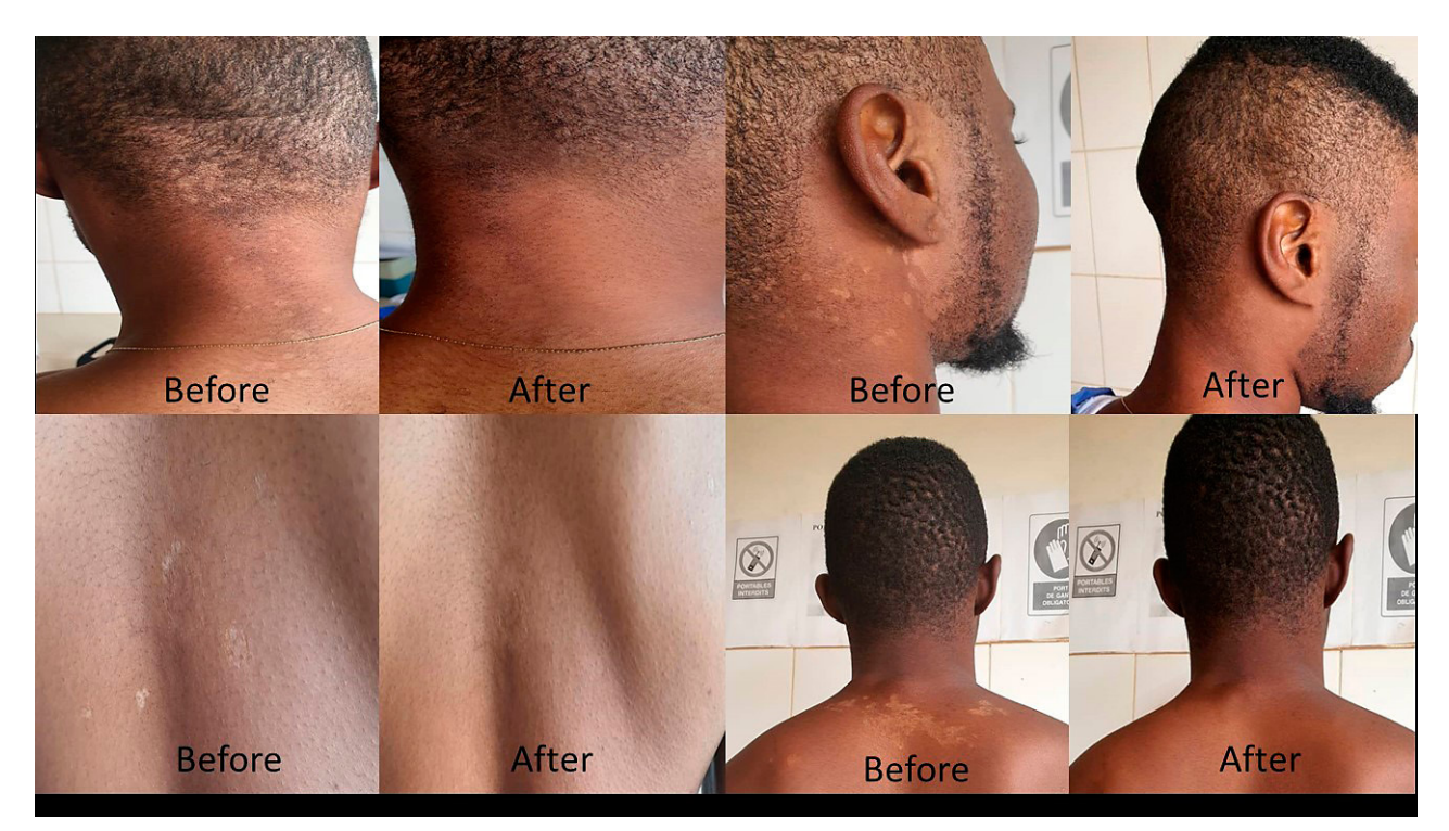
Figure 3. Sample photos of before and after treatment of Pityriasis versicolor with Mycofungi therapy

This randomized Terbinafine-controlled clinical trial demonstrated the efficacy of Mycofungi cream ( S. aromaticum ) to treat or reduce severity of skin mycosis.