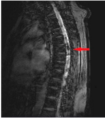
Figure 1c. Hemosiderin deposits at the level of Th5 to Th7. "Hemo" sequence.

The on-call neurosurgeon disqualified the patient from surgical treatment and ordered anti-haemorrhagic and anti-oedemic medication. The warfarin therapy was discontinued and fresh frozen plasma and vitamin K were administered. Unfortunately, the clinical condition of the patients remained unchanged and he was further discharged to a rehabilitation facility.